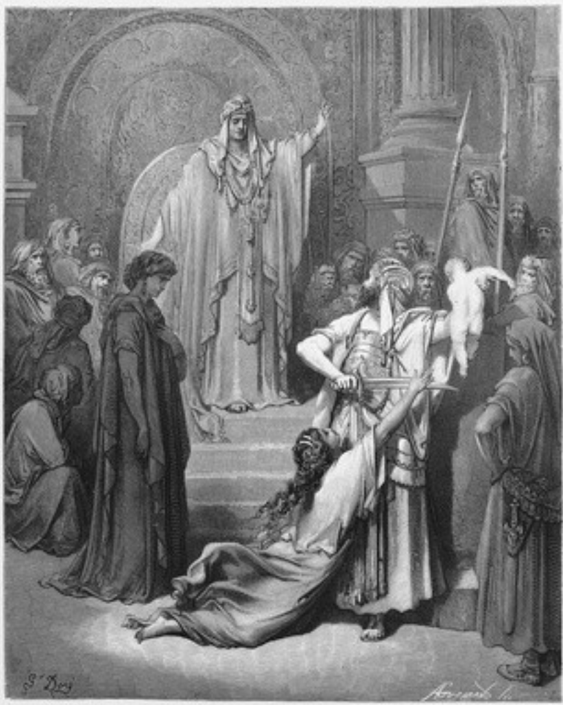
The Judgment of Solomon 1 Kings 3: 16-28

The Hebrew words racham , chesed and chanan and the Greek splagchna , oiktirmos , eleos are rendered „mercy“ in the English version of the Bible.